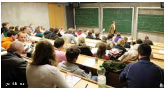
The focus in Schleswig-Holstein is on purposeful initial and further training measures; one outcome is a stable labour market.

The strength of the economy in Schleswig-Holstein is reflected in the positive development of the labour market.