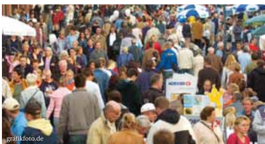
This crowded pedestrian precinct in Flensburg's town centre is a good example of how higher purchasing power in Schleswig-Holstein is boosting the economy and creating jobs.

Economic factors naturally play a major role in choosing the best possible location to set up a business. The combination of well-qualified and highly motivated personnel and relatively low labour costs is naturally a quality argument.